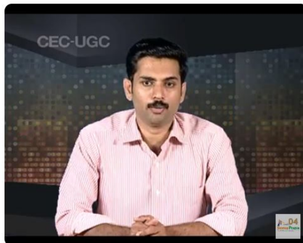
Misconception in Instruction